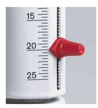
Positive volume setting using interior scalloped track