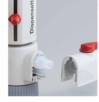
Valve system designed without seals