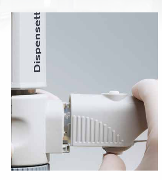
Simple-to-mount discharge tube