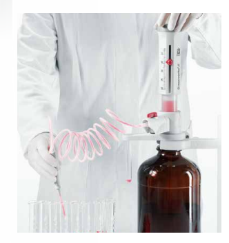
Accessories for serial dispensing