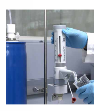
Remote Dispensing System for Drum Dispensing