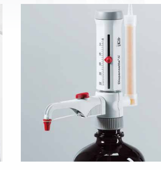
Dispensing sterile fluids