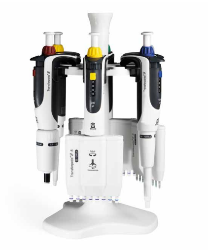
Bench top rack for 6 Transferpette® S single- or multi-channel pipettes.