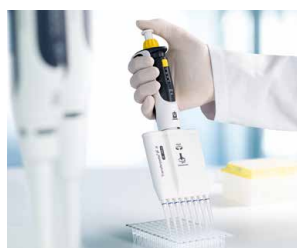
Working with PCR plates