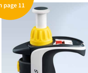
Easy Calibration technology