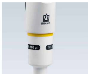
Integrated shaft coupling