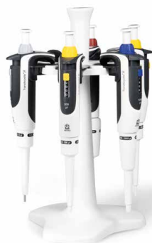
Pipette Package 2