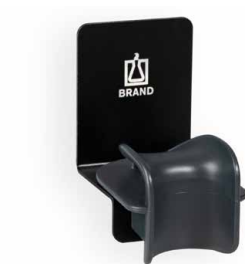
Wall mount for 1 Transferpette® S single- or multi-channel pipette.