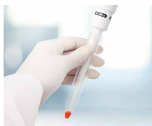
Narrow centrifuge tubes

Individual nose cones and seals can be easily removed for cleaning or replacement