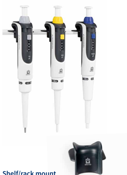
Shelf/rack mount for 1 Transferpette® S single- or multi-channel pipette.

With holders and stands, the devices are always properly stored and close at hand for the next application.