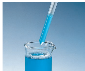
Positive displacement principle

Media which tend to foam, such as tenside solutions, pose no problem to the Transferpettor.