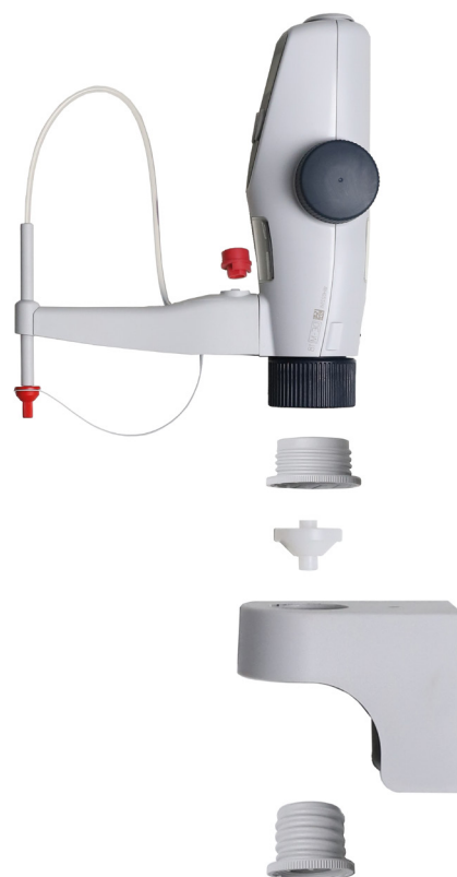
Titrette® extraction system for Bag-in-Box (Titripac® is a registered trademark of Merck KGaA, Darmstadt, Germany)

Find more information on the Titrette® and suitable accessories at shop.brand.de