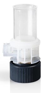
Dispensing cylinder with valve block