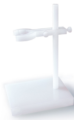
Bottle Stand PP. Full plastic construction. Support rod 325 mm, base plate 220 x 160 mm, weight 1130 g