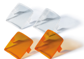
Inspection window 1 set colorless and 1 set amber colored (light shield)