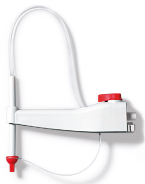
Titration tube with screw cap and integrated discharge and recirculation valve

Original Titrette® accessories ensure optimal work conditions in the laboratory.