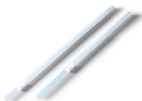
Telescoping filling tube FEP