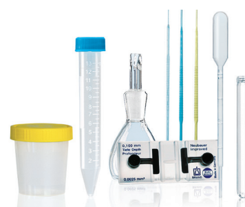
General Lab Products