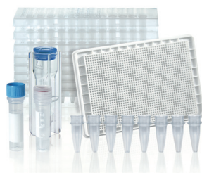
Life Science Consumables